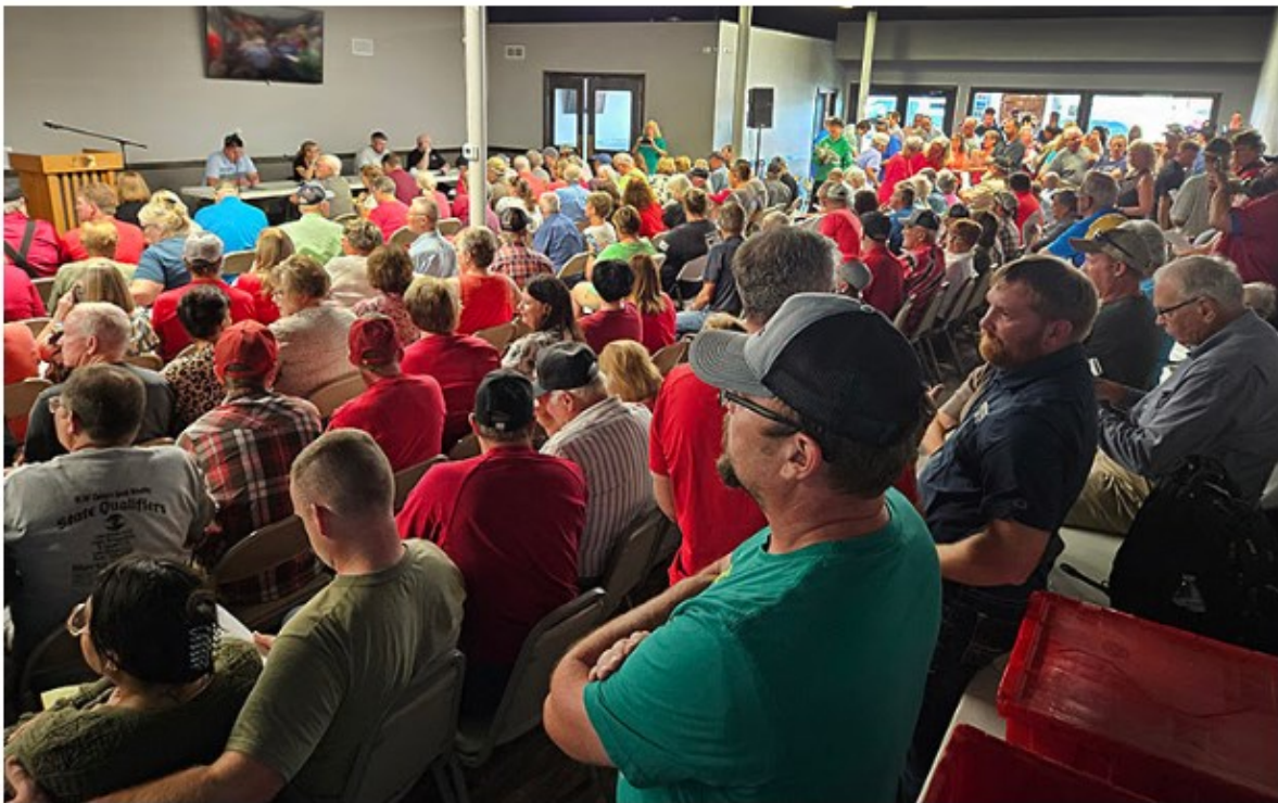
Landowners and other interested parties attend one of 23 IUC public informational meetings held throughout Iowa for the proposed SCS Carbon Transport pipeline trunk and lateral extensions.

On June 25, the IUC issued its final decision and order regarding Summit Carbon's petition for hazardous liquid pipeline permit. On August 5 Summit Carbon filed required compliance filings. After reviewing and approving the filings, the IUC issued an order on August 28, granting a hazardous liquid pipeline permit to Summit Carbon in Docket No. HLP-2021-0001.